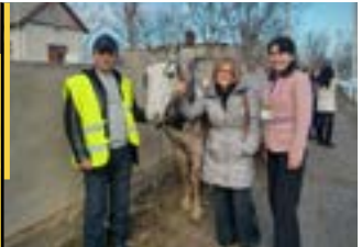
EBRD&EASST Project and road safety capacity training for local SCOs and stakeholders