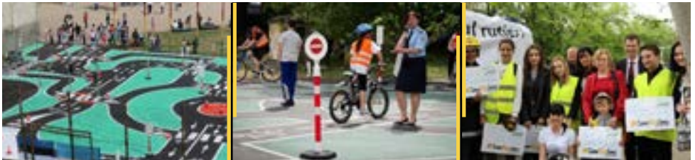
Support of the UK Embassy and firefighters