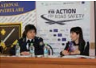
"Sober and Safe Villages" project in FIA Road Safety Grant Programme