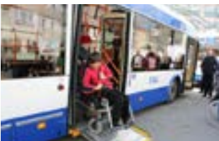
Survey: Disabilities, Mobility Road Risks in Moldova