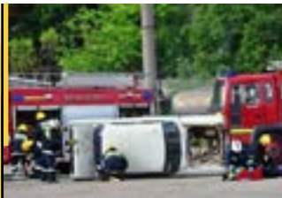
Road Safety Award by HRH Prince Michael for road police reform in Moldova