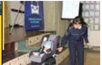
“Keep your kids safe in cars” project, supported by FIA, FIA Foundation, EASST, Parliament RM, Police and “Oratorul”