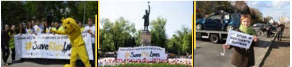
#SaveKidsLives Campaign at the central square and national statue in Moldova