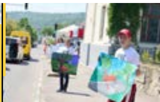
Flash-mobs, pop-stars and volunteers