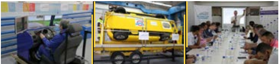
Working with fleets for improving occupational road safety management