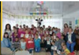
Fund-raising and reflectors to orphanages