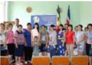
Rural areas: high vis materials, child restraints, trainings for local communities