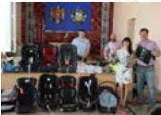
Drivers and better road traffic behavior