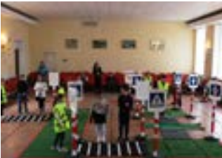
Safer and educated children