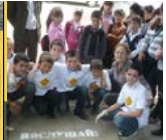
«Safe driving is life» Project